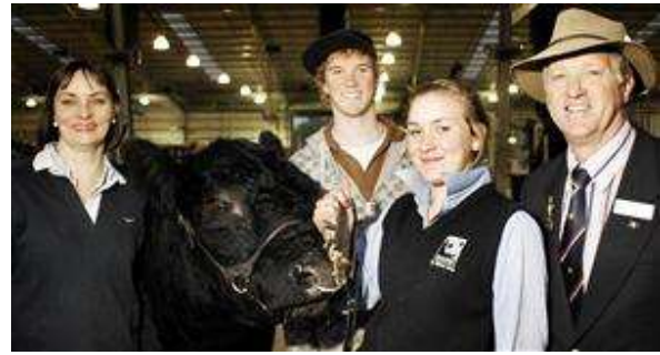
The Snaith Family