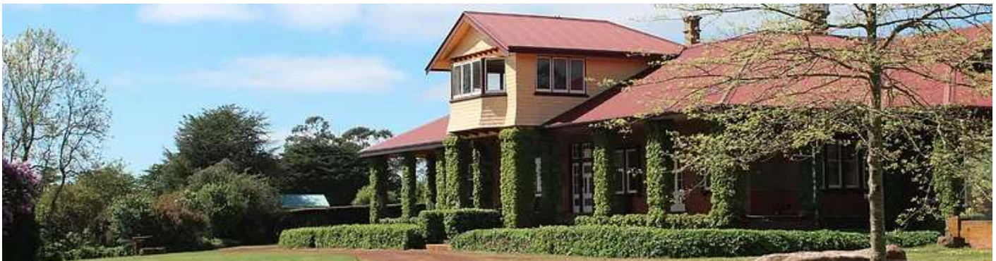
Brie Brie Homestead

Face Book: Glenthompson Pastoral WWW:GlenthompsonPastoral.com.au