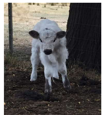
Balytyckle Miniature Galloway

Balytyckle miniature Galloway Farm in Yea. Is the next farm to visit where afternoon tea will be served. ( Face book: BALYTYCKLE MINIATURE. GALLOWAYS ) they have recently moved to 80 acres of picturesque Victorian hill country typical of the area. There are several dams, bore water and tanks, new fencing and cattle yards set up. They currently run two miniature white bulls and are hoping to