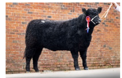
Blackcraig Moss Rose C1253

Thursday 15 th February & Friday 16 th February 2024