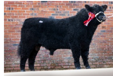
Quattro of Trolosse

40 Bulls & 36 Incalf and Bulling Heifers