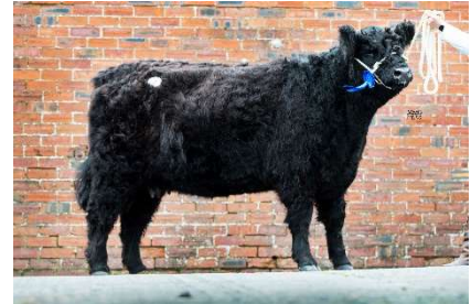
Brownie 5 th of Fingland

Thursday 16 th & Friday 17 th February 2023